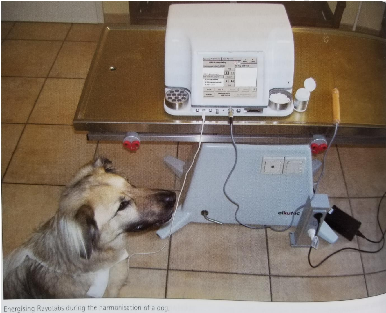
Energising Rayotabs during the harmonisation of a dog.

As determined the treatment frequency, by storing these frequency values in a carrier substance – water, lactose tablets, such as globules – you can extend and support the effect of bioresonance treatment perfectly. With regard to animal treatments, energizing a carrier substance that has been placed in the measuring cup, in parallel to running a program-based treatment has proven useful in practice, with polarizer is set to +/- . Alternatively, the original substance is placed into the protective cup, the transfer frequencies are entered; five minutes later (or more), the frequency spectrum of the original substance will be transferred to the globules. Lactose tablets have proven reliable for horses and dogs, whereas birds, rabbits and other small rodents can be given energized water in their drinking containers. A few drop of water are sufficient to transfer the information into the animal's body. The crucial efficacy factor here is not the amount of information that is administered, but the frequency of the information impulse.